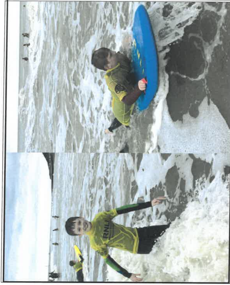
Making a big splash!: Hockering children surfing in Cromer