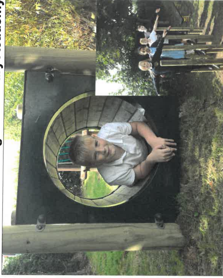
Outdoor Fun: We love playing on our new equipment.